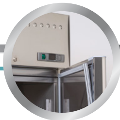
zamenljiva guma replaceable door gasket