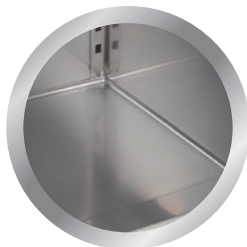
zaobljeni vogali rounded corners