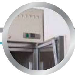
zamenljiva guma replaceable door gasket